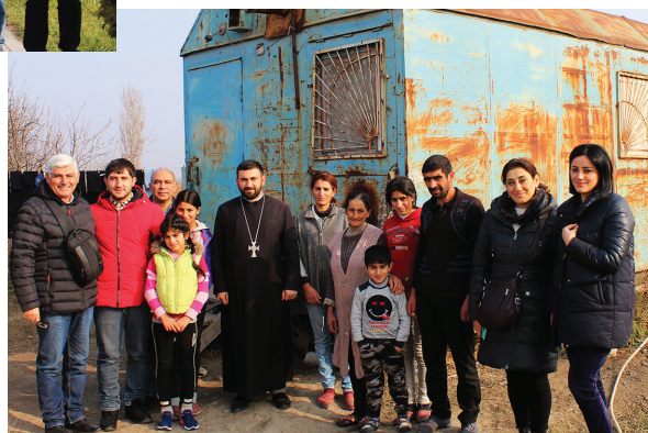
Spring Outreach - Yeghegnadzor City, Yeghegis village, Vayots Dzor region South-east Armenia near Azeri Autonomous Republic of Nachichevan