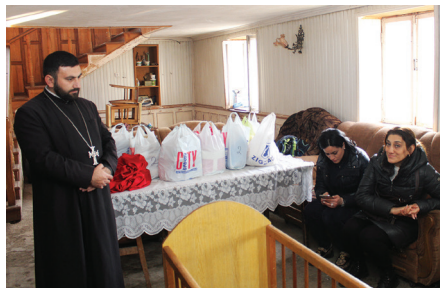
Christmas Outreach - Dashtavan village, Ararat region

OUTREACH TO FAMILIES IN NEED Several years ago, HOPE introduced Adult Core Group members to the Christian principle of personal stewardship, including the giving of time, talents, and resources to God's work personally. Many have participated as team members during Christmas and Easter seasons, receiving offerings, purchasing food necessities, and visiting families in need brought to our attention by local pastors. All have learned the privilege of sharing the story of God's Love in Coming to Earth! and Eternal Life Offered Through Jesus' Resurrection to Life! at these special times of year with those eager to receive both physical and spiritual food.