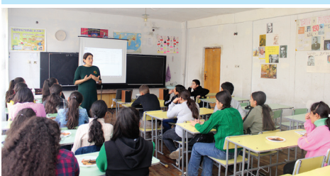
Gagarin village school Sevan region