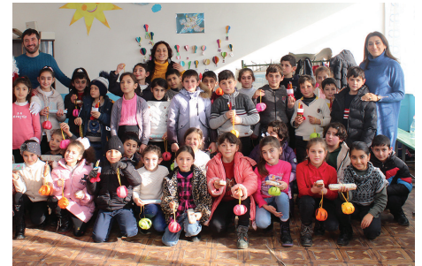
Ararat village school, Ararat region