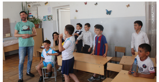
Nshavan village school, Ararat region