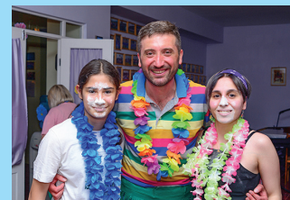
2 nd Hawaiian LUAU Outreach

Famous painting by Hovhannes Aivazovsky, 1889