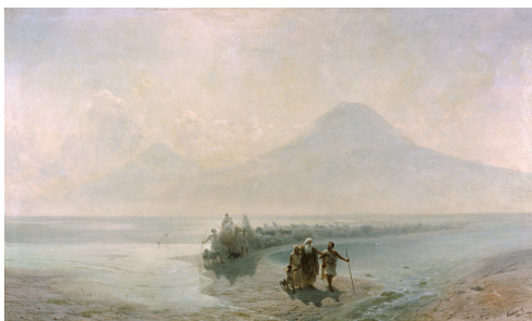
Descent of Noah from Mountain Ararat

Famous painting by Hovhannes Aivazovsky, 1889