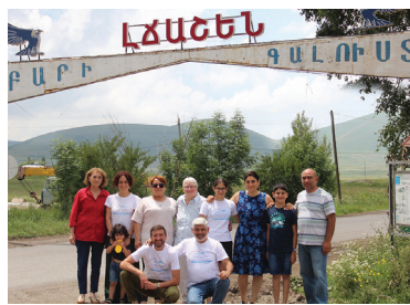
Camp #3 (45 kids) - Lchashen village, Gegharkunik region (Sevan)