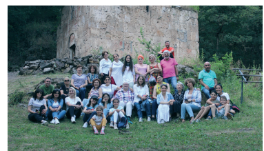
HOPE FAMILY ANNUAL EXCURSION – Aghavnavank Church, Tavush region (built 11 th – 13 th centuries)