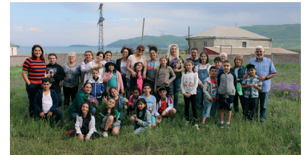
KIDS' PLANET DAY – LIGHTHOUSE center, Tsovaguygh village near Lake Sevan