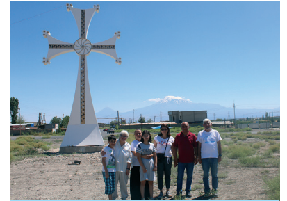
Summer Youth Day Camp Team