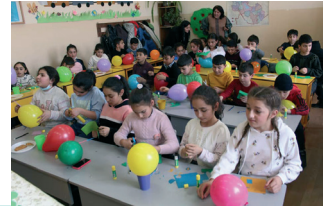
KIDS' PLANET – Vardashen, Ararat region