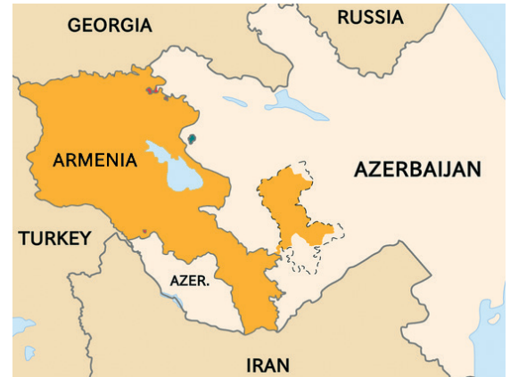
Armenian territory after the 44-Day War in 2020

A commission has been set up concerning the issue of specifying the borders of Armenia and Azerbaijan. In solving these problems, the United States and Europe have carried out positive activities which support the process of popularization of Armenia and increasing the role of Armenia in the region.