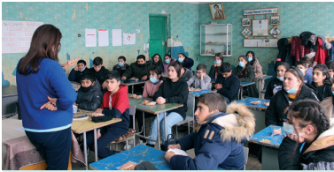
BASICS – Varsar, Sevan region