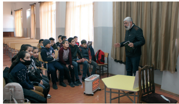
BASICS OF CHRISTIAN FAITH

Varser village school, Gegharkunik region