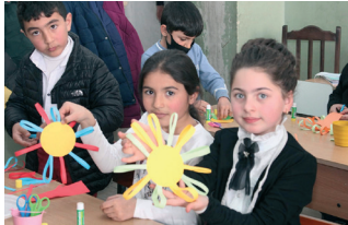
KIDS' PLANET – Kanachut village school, Ararat region