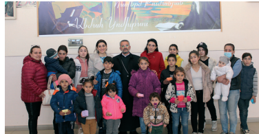
FAMILY PROGRAM – Karin village, Aragotsotn region