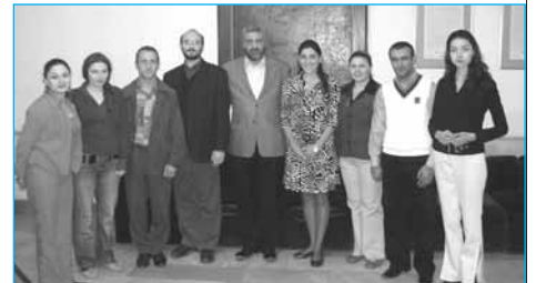
Discipleship Group #3 team with the Primate of the Araratyan Diocese

We are now beginning our 4th Young Adult Discipleship program in a local church in Yerevan center. Once again, we're pleased to have around 22 eager participants, and our team continues to grow as well, with 10 leaders and helpers. We're excited that our first Adult Discipleship course (by popular demand!) has also started in the same local church on Thursday afternoons, just before the evening discipleship program.