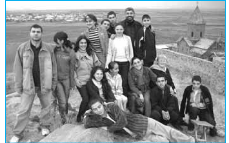
Jrashen youth kids

This spring, we're beginning a second 15-week discipleship program in Jrashen village, with a new batch of middle teenagers (14-16 years of age). Soon we'll begin bi-monthly follow-up lessons (by popular demand!) with the first group which met last autumn.