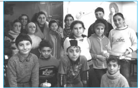
3rd District kids

We've completed two-year program with the kids from low socio-economic backgrounds at this youth center. Our team enjoyed taking several excursions with them to historic churches. Overall, their response to introductory biblical lessons has been positive, and we feel they are ready to move on to deeper spiritual topics with the staff there.