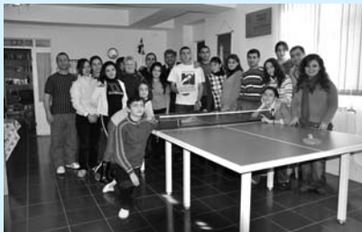
December 5 Spiritual Gifts Seminar