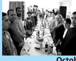
October 24-25 Leadership Seminar with Light of the World organization