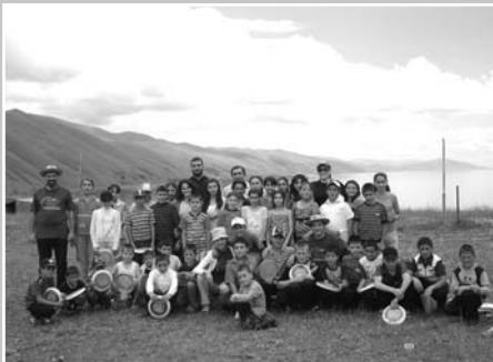
June 24-26 Summer Youth Camp Tsovagyugh village