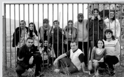
October-December Young Adult Discipleship #7