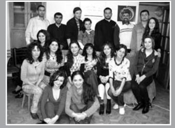
February - May Parables of Jesus Bible Study