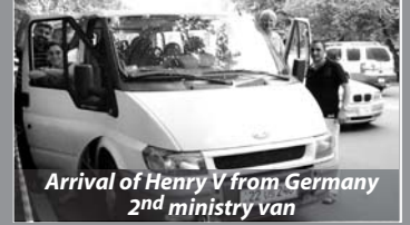
Arrival of Henry V from Germany 2nd ministry van