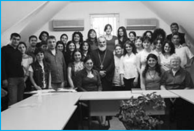
March-May Young Adult Discipleship program #8