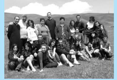
May 15-16 Parables of Jesus Retreat