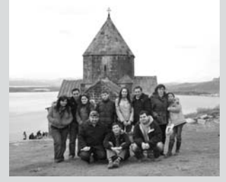
March 27-28 Evidence for the Resurrection Seminar