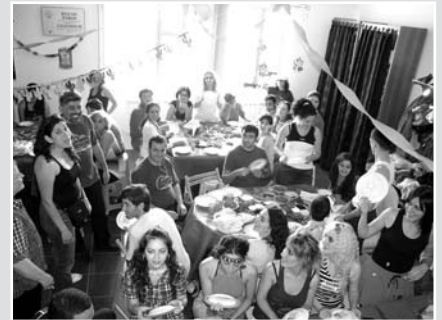
...first experience with tacos and pinata!