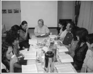
September 28 Ministry Team Training Seminar