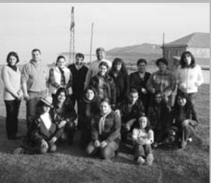
April 17-18 Young Adult Discipleship #8 Retreat