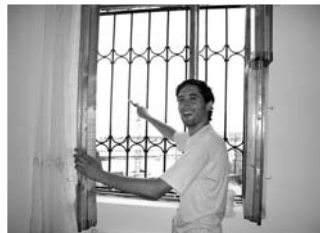
July 25-27 Volunteer Work Days Lighthouse Training Center