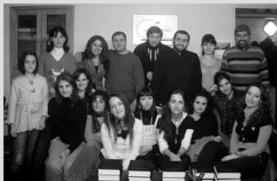
October-December Parables of Jesus Young Adult Bible Study