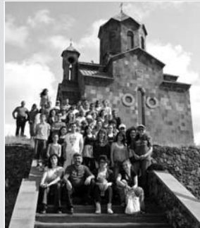
July 18 - morning Hiking to Tsaghkunk Church (Lake Sevan region)