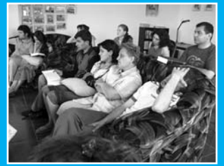
July 3-4 Summer Bible Study Retreat New Testament Book of James