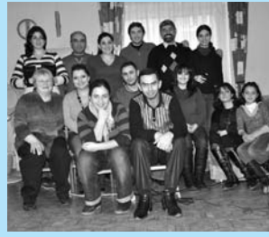
January 23 Annual Staff Retreat Lesson 1: Sowing the SEED Lesson 2: Building on the ROCK