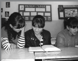
October - December Jrashen Youth Discipleship follow-up program