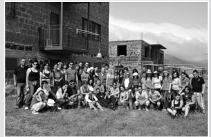
July 18 - afternoon Mexican Festival Lighthouse Training Center