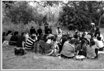
June 20 Annual HOPE Family Excursion to Goshavank Church (12 th century)