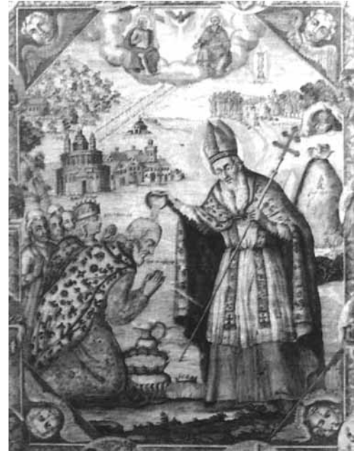
St. Gregory - 4th century Armenian Evangelist

altogether, and in 301 A.D. declared Christianity to be the state religion of Armenia. Heathen temples were destroyed, and Christian churches were built in their place. Despite this official acceptance of Christianity, it was difficult for people to reject heathen ceremonies and rituals altogether. Paganism gave its place to Christian faith only with great difficulty.