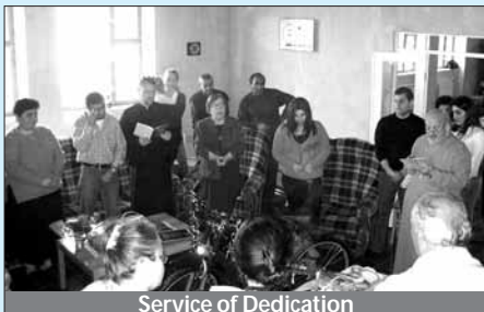
Service of Dedication