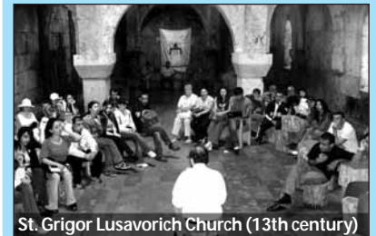
St. Grigor Lusavorich Church (13th century)

for staff & ministry volunteers (and new friends!)